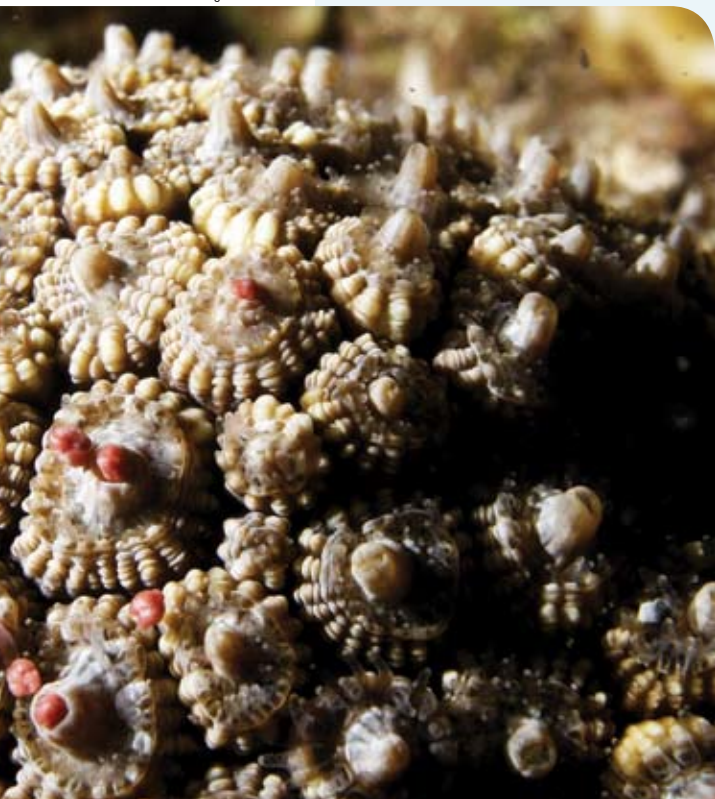
Montastraea spawning

Three types of coral nursery have been set up close to the Bolinao Marine Laboratory in the Philippines. These include one floating nursery, one bottom-attached nursery and one low-cost experimental rope nursery. The floating nursery has the advantage that corals are held at a constant depth (the whole nursery moving up and down with the tide). Further, in the event of El Niño warming the corals can be moved to greater depth or the nursery towed to a site with better mixing. The bottom-attached nursery is cheaper to make but water depth varies with the tide. The experimental rope nursery is very cheap as coral fragments are just slipped between the strands of a rope and then allowed to grow. Approximately 10,000 1-4 cm coral nubbins derived from 17 donor colonies belonging to nine species have now been reared for about one year. Results after one year show that overall about 10% mortality and 6% detachment of coral fragments is achievable. Preliminary results show not only significant differences between species in terms of growth and survival, but also between different genotypes of the same species. Faster growing species have already grown into small