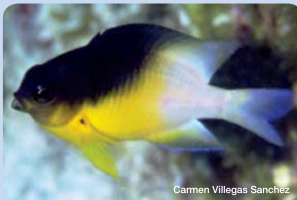
Carmen Villegas Sanchez

Detailed knowledge of the spatial patterns of larval dispersal, the so called dispersal envelope, could help determine whether: (i) the size of a planned NTR will ensure self-recruitment; (ii) the placement and spacing of NTRs will promote persistence of target populations through dispersal amongst them; and (iii) the sizes, spacing and placement of a network of reserves will maximize potential fishery benefits on neighboring fishing grounds through recruitment subsidy. Our knowledge of dispersal envelopes is limited because patterns of larval dispersal are species, site, and time specific and are driven by a complex of sensory, behavioral, physical and hydrodynamic processes.